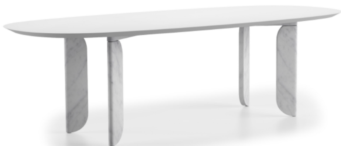
■ T873003XNA (draft Image)