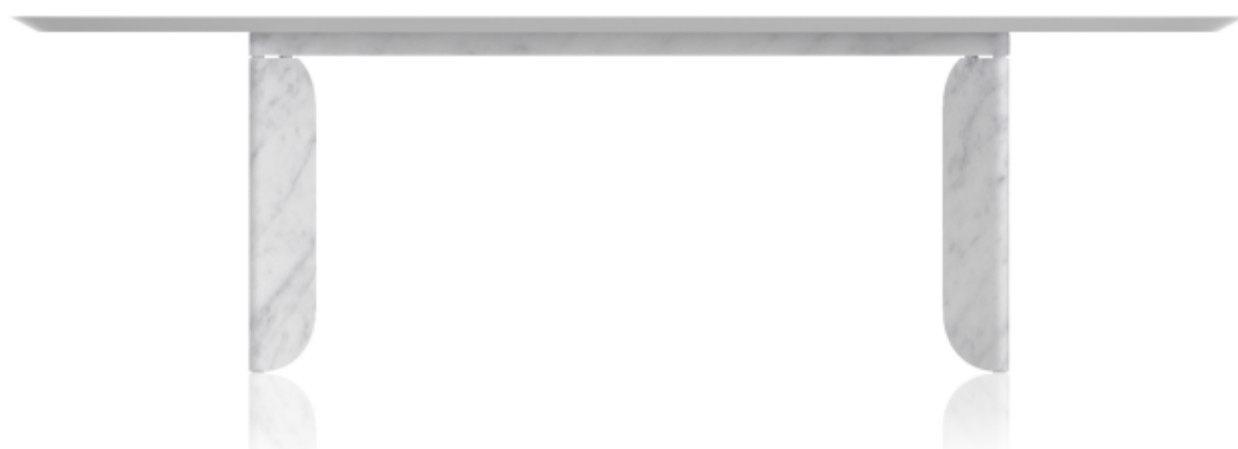
■ T873003XNA (draft Image)