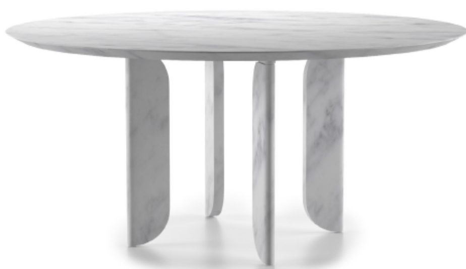
■ T873002XNA (draft Image)